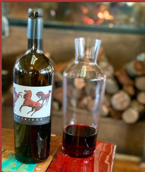
taken at Press in St. Helena

Our Spring featured wine is the 2014 Cabernet Sauvignon. A big style that is rarely attainable in our Chiles Valley Vineyard.